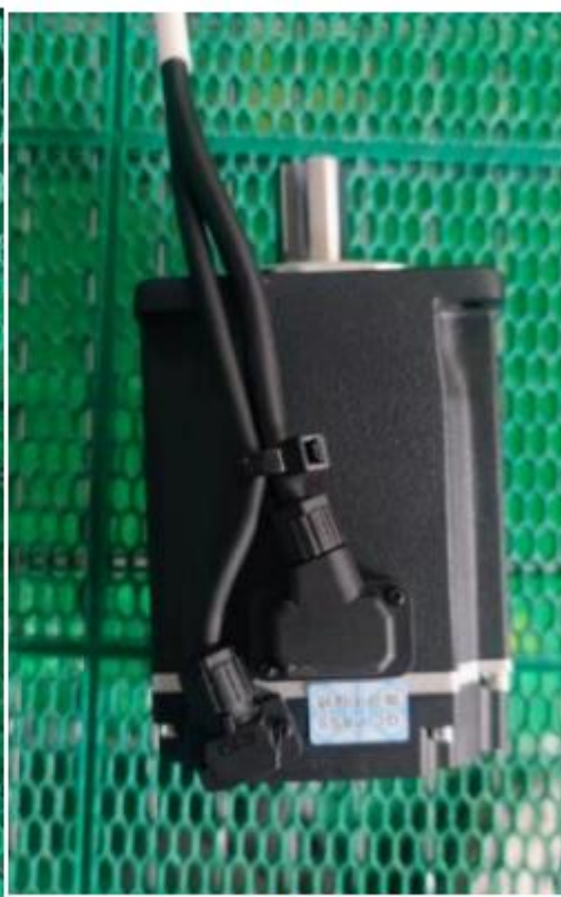
安装后 after installation