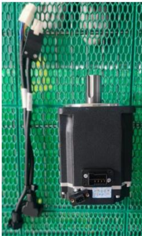
安装前 before installation